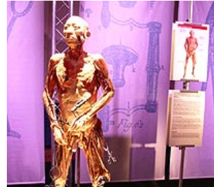
A display at " Bodies Revealed ... the Exhibition"

``They can make their way through models and recreations of the heart, lungs, ears,